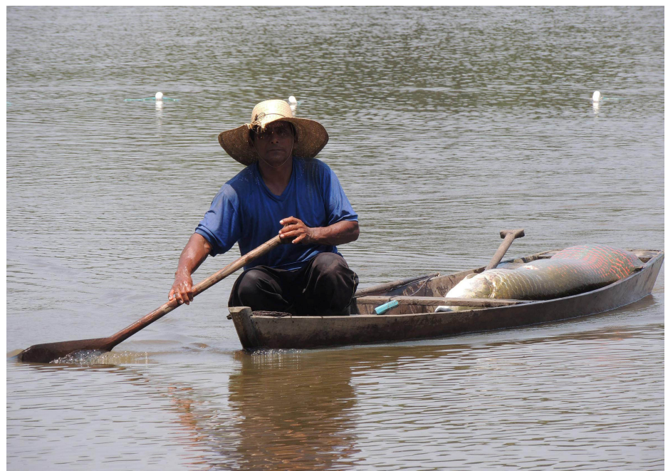
Figure 3. Invasive Arapaima gigas (pirarucu) fished by a local angler in Mamoré River at Brazil-Bolivia border.

pristine environments, facilitating biological invasions (Lima-Junior et al. 2018; Bezerra et al. 2019b). Aquaculture without adequate controls (e.g., without effective barriers to prevent dispersion of organisms) has the potential to spread alien species (Orsi and Agostinho 1999; Latini et al. 2016; Casimiro et al. 2018). Invasive species released from aquaculture projects generate significant ecological consequences, such as changes in